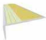
F10-151 Yellow slip resistant silicon carbide + Photoluminescent Strip

The F10-171 can be used on a range of substrates such as concrete, timber, tiles, vinyl, steel and checker plate. Installation is a simple process using fixers (supplied) and glue. It can also be fitted over steps with an industrial or commercial type carpet (with no underlay) and up to 6mm thick.