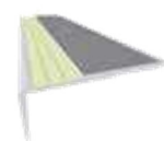
F10-161 Grey slip resistant silicon carbide + Photoluminescent Strip